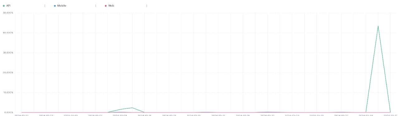
Error Response Rate - NL

Please note: where there is one colour displayed in the graphs, it means the online services have the same result.