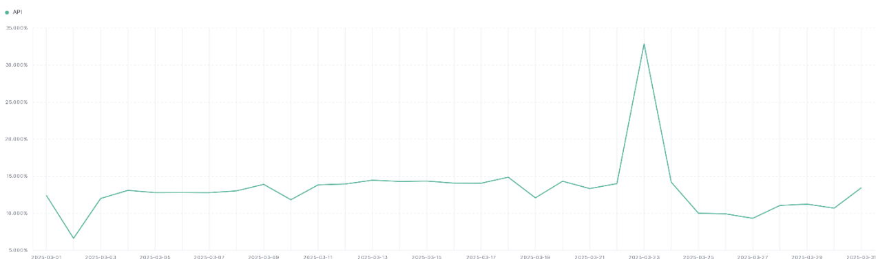
Error Response Rate - FI

Please note: where there is one colour displayed in the graphs, it means the online services have the same result.