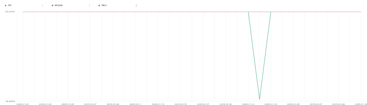
Average Uptime Rate - SE

The chart below contains the average uptime rate as a percentage per day, for Handelsbanken's PSD2 APIs as well the Mobile App and Online Banking services.