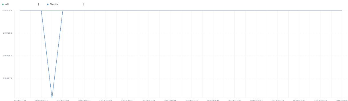
Average Uptime Rate - FI

Please note: where there is one colour displayed in the graphs, it means the online services have the same result.