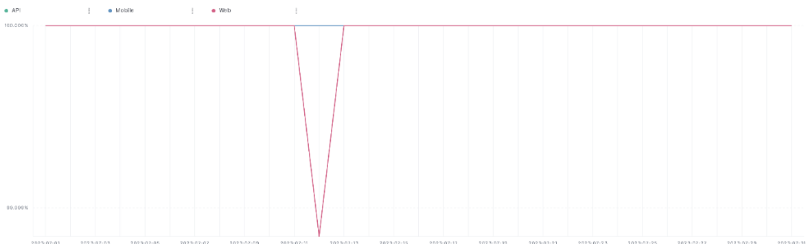
Average Uptime Rate - GB

Please note: where there is one colour displayed in the graphs, it means the online services have the same result.