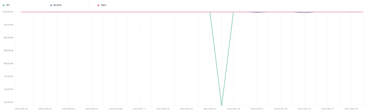
Average Availability Rate - NL

The chart below contains the availability rate as a percentage per day, for Handelsbanken's PSD2 APIs as well the Mobile App and Online Banking services.