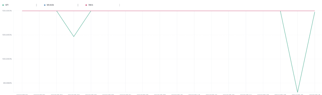
Average Uptime Rate - SE

Please note: where there is one colour displayed in the graphs, it means the online services have the same result.