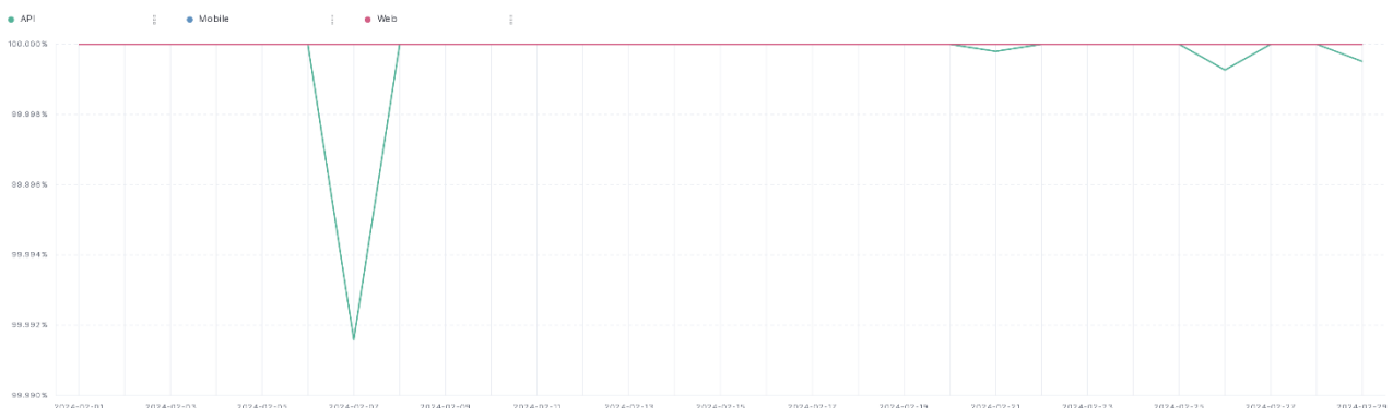
Average Uptime Rate - SE

Please note: where there is one colour displayed in the graphs, it means the online services have the same result.