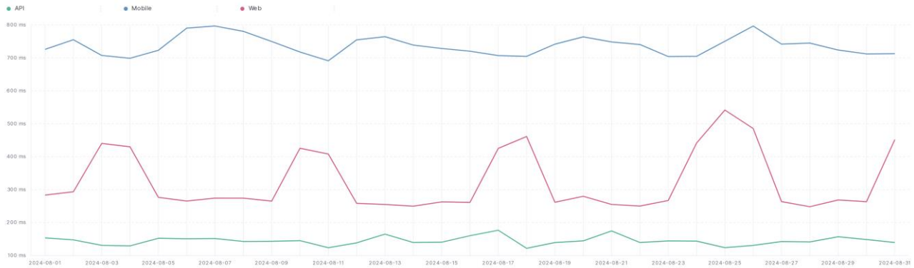
Average Response Time - GB

The chart below contains the average response time in milliseconds per day, for Handelsbanken's PSD2 APIs as well the Mobile App and Online Banking services.