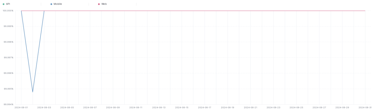
Average Uptime Rate - GB

The chart below contains the average uptime rate as a percentage per day, for Handelsbanken's PSD2 APIs as well the Mobile App and Online Banking services.