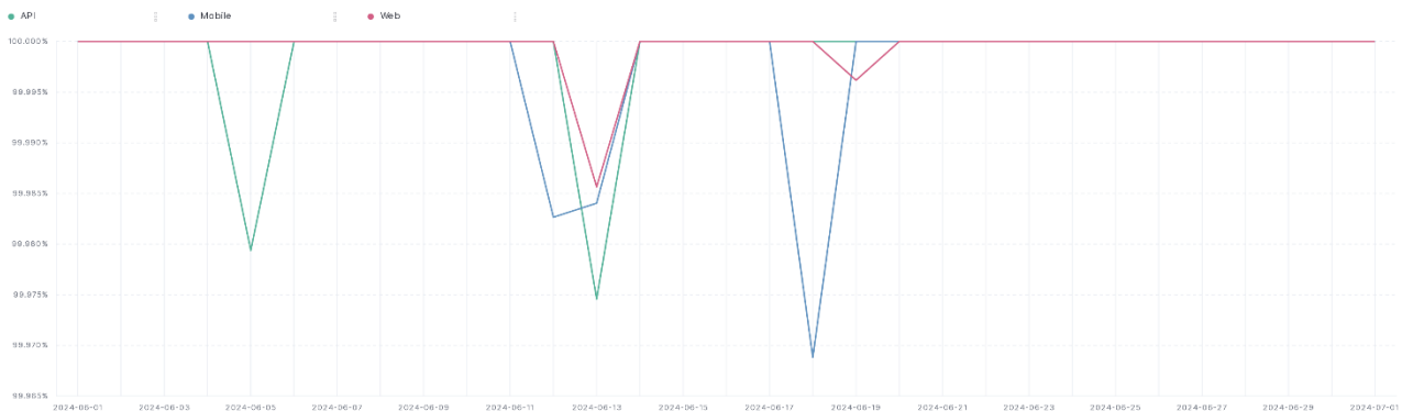
Average Uptime Rate - GB

The chart below contains the average uptime rate as a percentage per day, for Handelsbanken's PSD2 APIs as well the Mobile App and Online Banking services.