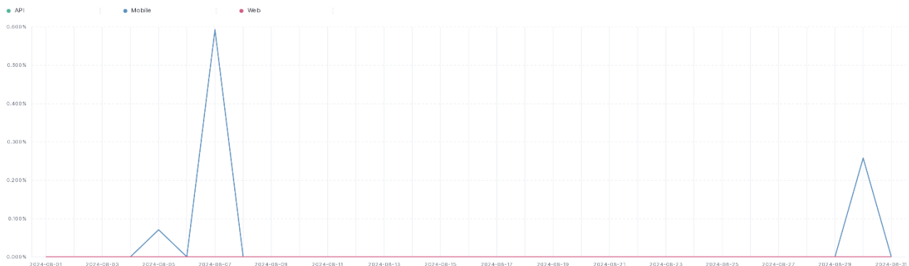
Error Response Rate - NL

Please note: where there is one colour displayed in the graphs, it means the online services have the same result.