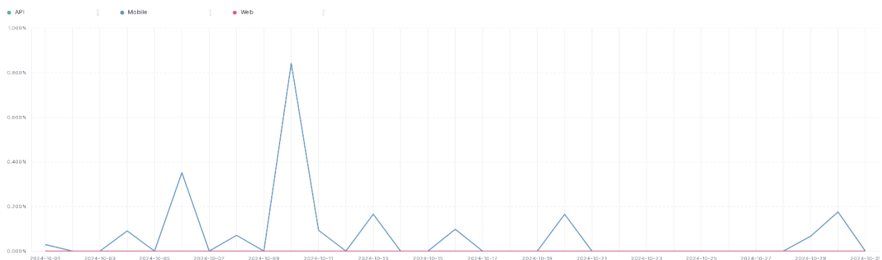
Error Response Rate - NL

Please note: where there is one colour displayed in the graphs, it means the online services have the same result.